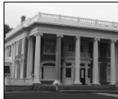
Work began last June on the roofline balustrade and now it looks like it did in 1901-02.